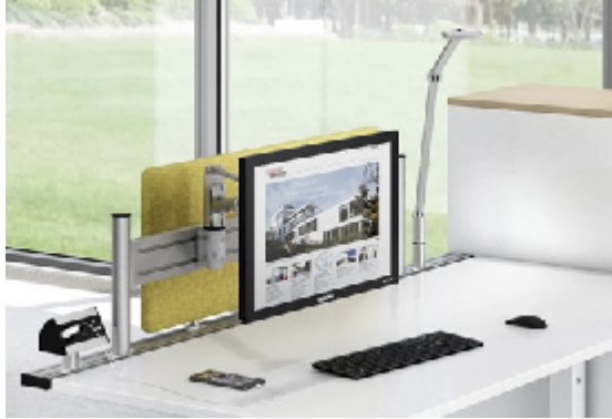
2-track Flexter organisational rail for individual workstations