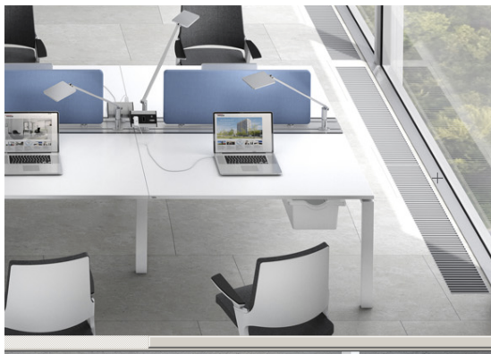
3-track Flexter organisational rail for back-to-back workstations or benches